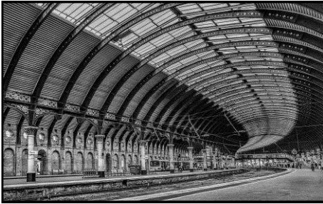
2nd York Train Station Glyn Heywood