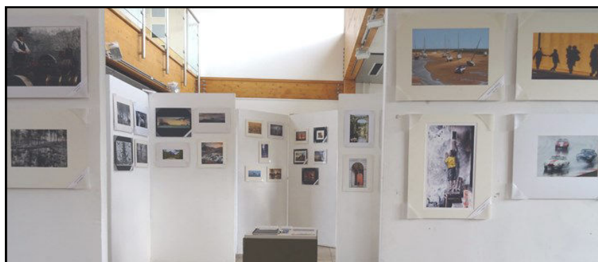
Chasewater Innovation Centre