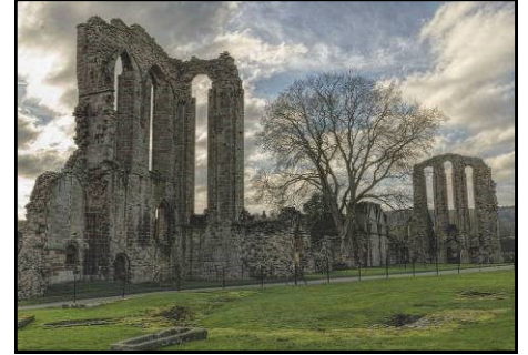
3rd Croxden Abbey Glyn Heywood