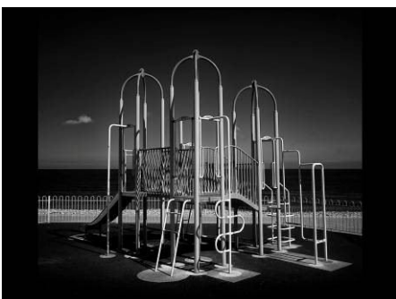
2nd 'The Three Wise Men' Alan Griffiths