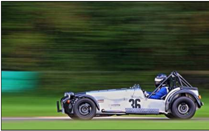
2nd 'Racer 36' by Ian Cheetham