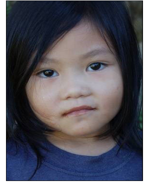
3rd 'Amelia' by Lorraine Barker