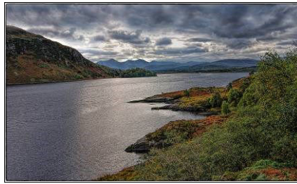
1st 'Ring of Kerry'