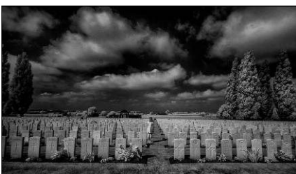
2nd 'Lost' by Paddy Ruske