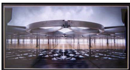
SECOND Birmingham Library Alan Griffiths