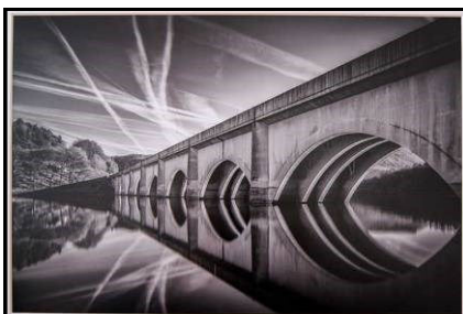
FIRST Ashopton Viaduct Brian Wheatley