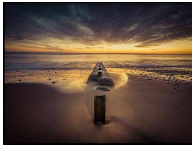
FIRST 'Seaham Beach' by Brian Wheatley