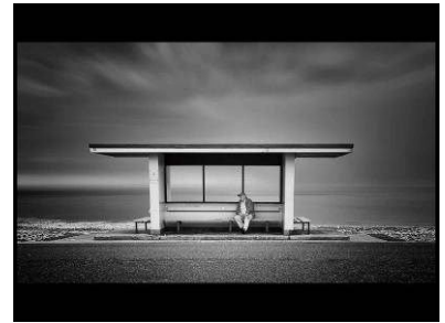
FIRST 'Waiting For God' by Alan Griffiths