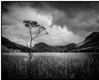
FIRST 'Lone Tree Buttermere'