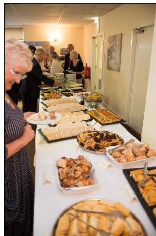
Probably the most important part of the evening... the food...