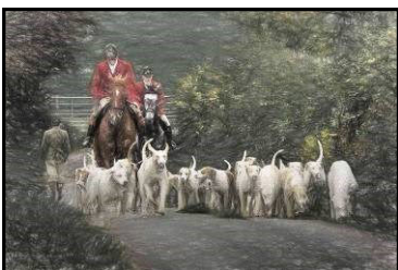
FIRST Coming Up Egg Lane By Roy Westwood