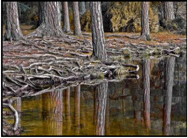
FIRST Where the Wood Meets the Lake By Jad Winfield