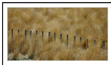
SECOND Fence & Grass By Paddy Ruske