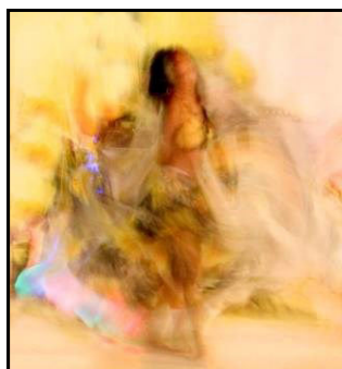
ADVANCED 'DANCER' PADDY RUSKE