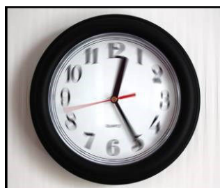
INTERMEDIATE 'TIME GOES SO QUICK' BRENDA PAGE